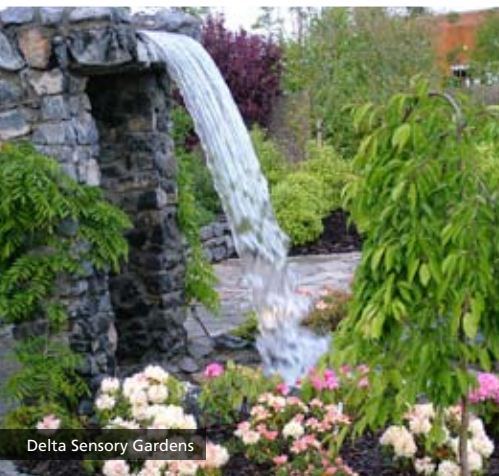
Delta Sensory Gardens

Carlow is Ireland's most intriguing, accessible county, waiting to be explored. Surrounding a vibrant town bustling with creative arts, culture, entertainment and VISUAL – Ireland's award winning Contemporary Art Centre, its countryside awaits you with soft rolling hills, majestic golf courses, gentle landscapes and calming endless waterways. Renowned beautiful gardens, an award winning Christian Heritage Trail – Trail of the Saints, iconic attractions, magnificent mountains and endless activities provide you with a visitor experience that will captivate you to stay longer. Rich in history, with colourful picturesque character villages, Carlow is an endless county to explore, easy to get to yet hard to leave.